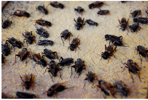
Fig. 1 Gryllus bimaculatus farmed in Khon Kaen Province, Thailand

agricultural process through to consumption in the home or restaurants and waste disposal. LCA is just one among several different environmental impact assessment methods; however, it is recognized as the most complete, it is used for the majority of food products and supply chains, and it has been adopted as the methodological base for environmental declaration schemes (Notarnicola et al. 2015).