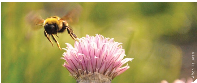
Bees play a vital role in the pollination of plants worldwide

Insects provide other important and useful functions beyond food and feed: