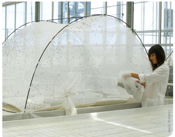
Black soldier flies are reared in Spain to be used as a raw ingredient in animal feed

More than 1 900 edible insect species are consumed around the world. However, this number continues to grow as more research is conducted. The majority of these known species are harvested in the wild; however, few data are available on the quantities of insects consumed worldwide. From the data that are available, the most