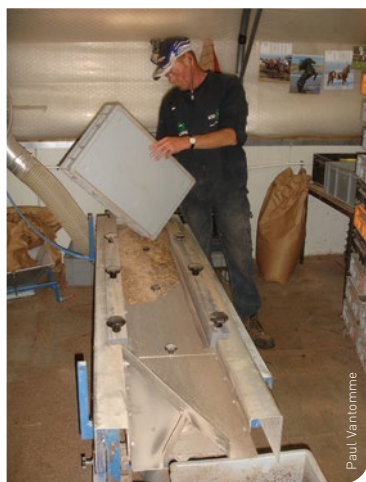
Mealworms are sorted prior to freeze drying and packaging, Netherlands

Yes. Population growth, urbanization and the rising middle class have increased the global demand for food, especially animal-based protein sources. The traditional production of animal feed such as fishmeal, soy and grains needs to be further intensified in terms of resource efficiency and extended through the use of alternative sources. By 2030, over 9 billion people will need to be fed, along with the billions of animals raised annually for food and