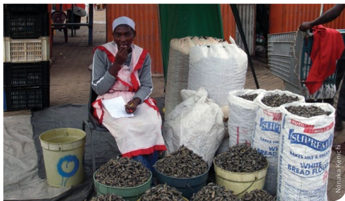
Dried caterpillars at a local market in Southern Africa

A common misconception of insects as food is that they are only consumed in times of hunger. However, in most instances where they are a staple in local diets, insects are consumed because of their taste, and not because there are no other food sources available. Certain insect species, such as mopane caterpillars in southern Africa and weaver ant eggs in Southeast Asia, can fetch high prices and are hailed as delicacies.