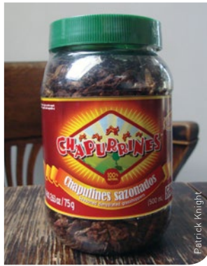
Grasshoppers, known as chapulines in Oaxaca, Mexico, are a local delicacy

"Research is required to develop and automatize cost-effective, energy-efficient and microbially safe rearing, harvest and post-harvest processing technologies as well as sanitation procedures to ensure food and feed safety and produce safe insect products at a reasonable price on an industrial scale, especially in comparison to meat products." (Rumpold and Schlüter, 2013)