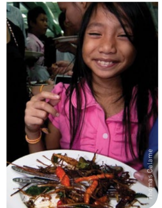
Edible insects are prepared for a cooking competition in Laos